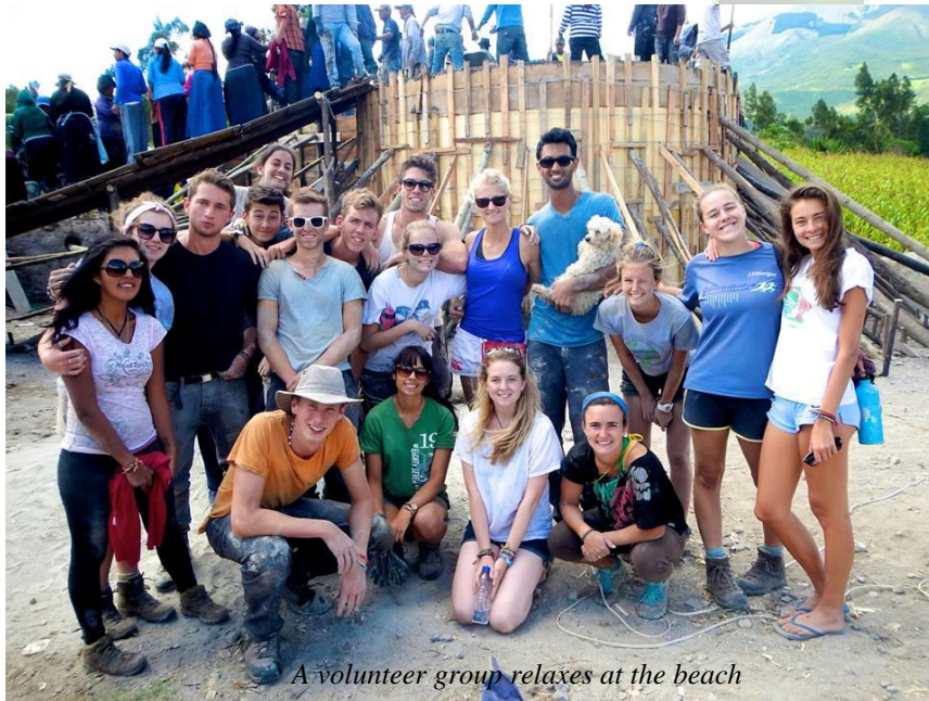
A volunteer group relaxes at the beach

While the fairs produced some results in terms of winning volunteers, it was more effective in the end in making contact with other organizations involved in offering gap year programs and creating new links to receive volunteers and groups in the future.