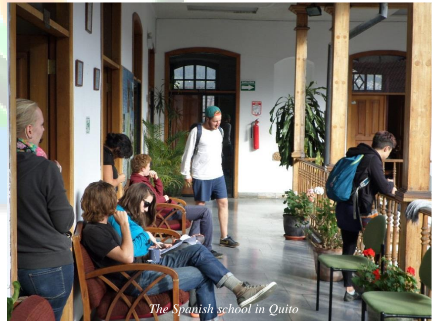
The Spanish school in Quito

So moving to group classes offers us a means of reducing the number of teachers while maintaining a good number of students. In order to do this we need to extend our network of agencies that send students primarily to group classes rather than relying on individual registrations through the website.