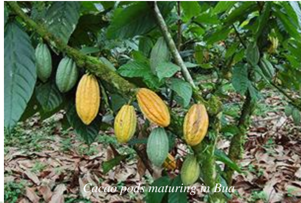
Cacao pods maturing in Bua

During the year we carried out two visits to long-established farms and organizations working with national varieties of cacao that are produced either sustainably or organically. These visits are always an inspiration for the Tsa'chila farmers who rarely venture beyond their own comunas and whose access to good information about the possibilities for developing their farms are very limited. Seeing the mature and well-laden trees and hearing