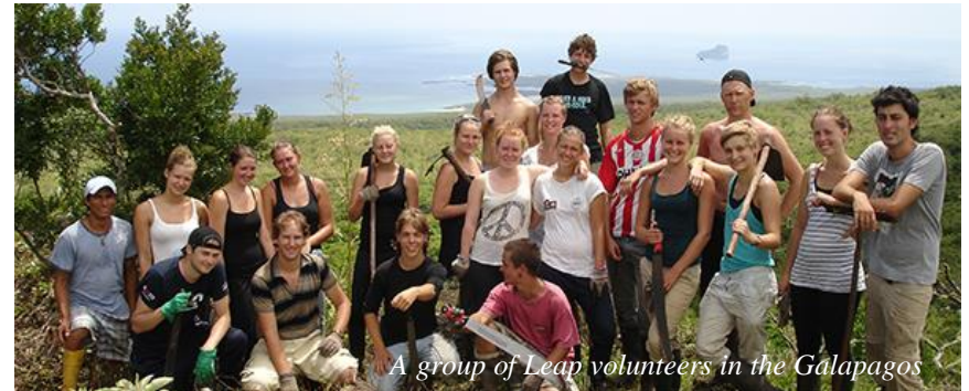
A group of Leap volunteers in the Galapagos

Principally the work involves uprooting and eradicating invasive species of plants that replace tradition food supplies for the endemic fauna such as the giant tortoises. It is an endless job and one we are happy to continue supporting in the future.