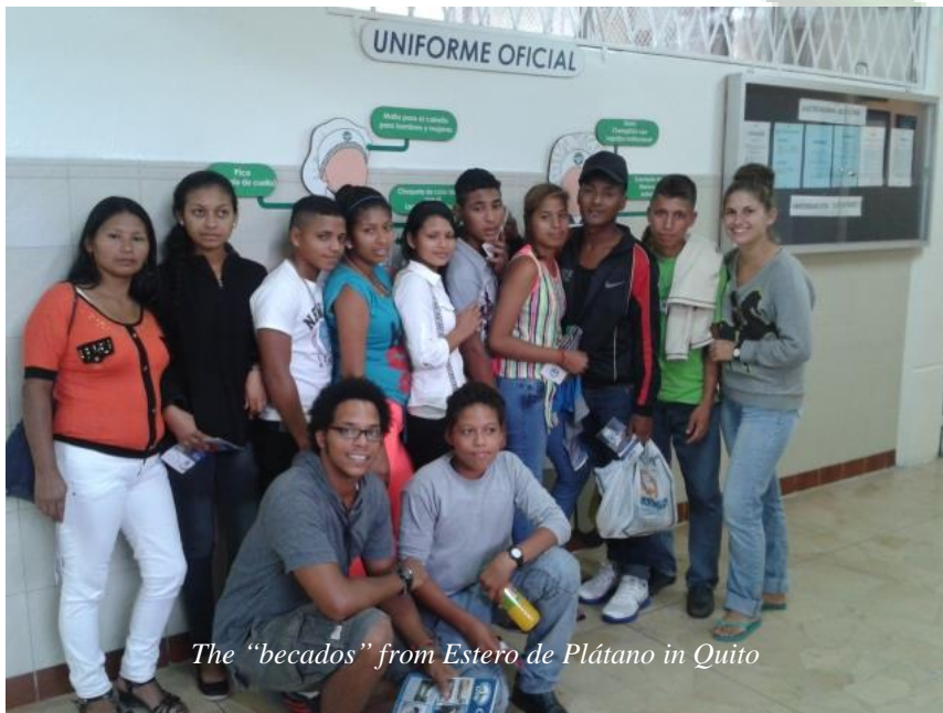
The "becados" from Estero de Plátano in Quito

We always comment to volunteers that they may or may not feel totally satisfied by the time that they finish their volunteering - it depends on the project and whether they get to see it from start to finish or just contribute to a little bit in the middle. So when one