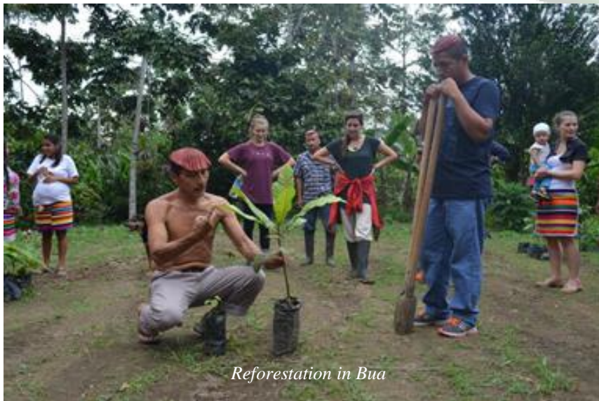
Reforestation in Bua

Over the past two years we have worked with the members of the Shinopi Bolón cultural group in the comuna Bua, purchasing up to 8000 saplings of native varieties from them. They gather the seeds locally and prepare a nursery to raise the saplings in bags for transplanting by groups of students and volunteers like Thinking Beyond Borders who planted out nearly 8000 saplings in February. We have been pleased to see how easy it has become for us to rely on them to carry out this micro-enterprise, and we will continue to see if we can help them to extend beyond merely supplying us with saplings and sell these to others in the province of Santo Domingo and beyond.