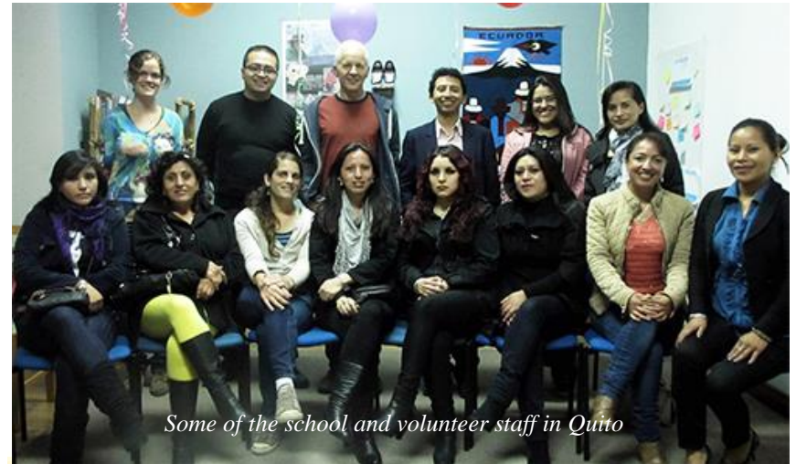
Some of the school and volunteer staff in Quito

We look forward to setting the new agency in motion during 2015, once the relevant paperwork is processed and permissions granted. Although the Superintendencia de Compañías now