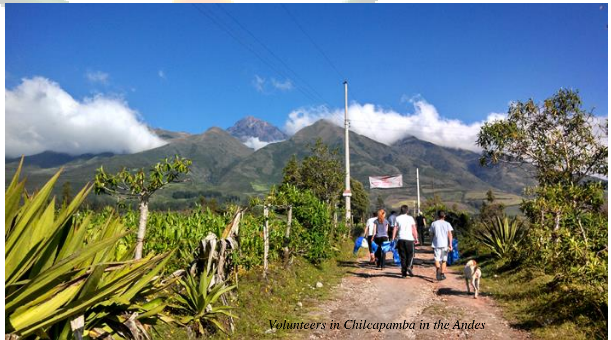
Volunteers in Chilcapamba in the Andes

Please feel free to email us with any questions or comments. You can contact us at: volunteer@yanapuma.org