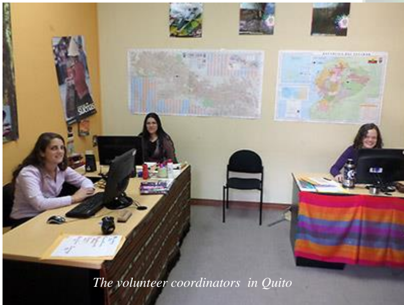
The volunteer coordinators in Quito